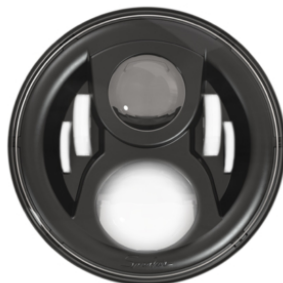
STANDARD HIGH BEAM