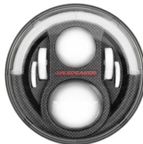
DUAL BURN™ HIGH BEAM